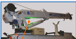
Boom Mounted Status Light