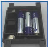
Reserve Battery Pack