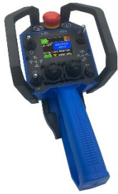
NexStar 4 Remote