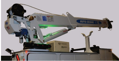
NexStar 4 Crane